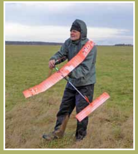
Phil Ball with his F1G winning model. When the class was new in the UK most models were not much bigger than the tail plane on Phil's model!

The central venue allowed more from the North to attend and apart from a couple of notable exceptions such as Peter Hall (5 times winner), most of the usual protagonists were on hand to do battle. F1G also saw a welcome French entrant, Didier Chevenard, who looked in a strong position till the penultimate round, when an energetic launch removed the outer panel of his six-panel wing. He had used some Gorban parts, including the motor tube, but when building the wing he had used a 1mm fibreglass dihedral brace